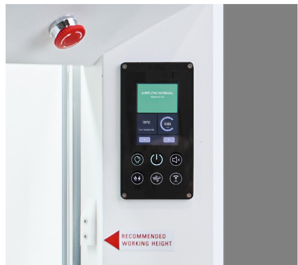
The EcoAir® IV Controller comes with a vertically oriented, touch-type control panel that can be mounted on either the left or right column of a fume cupboard. This example shows the control panel mounted on an EcoAir® fume cupboard.